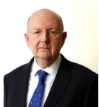
Convener Bill Bowman Scottish Conservative and Unionist Party