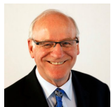
Gil Paterson Scottish National Party