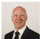
Joe FitzPatrick Scottish National Party