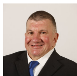
Jeremy Balfour Scottish Conservative and Unionist Party