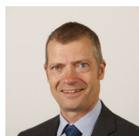
Graham Simpson Scottish Conservative and Unionist Party