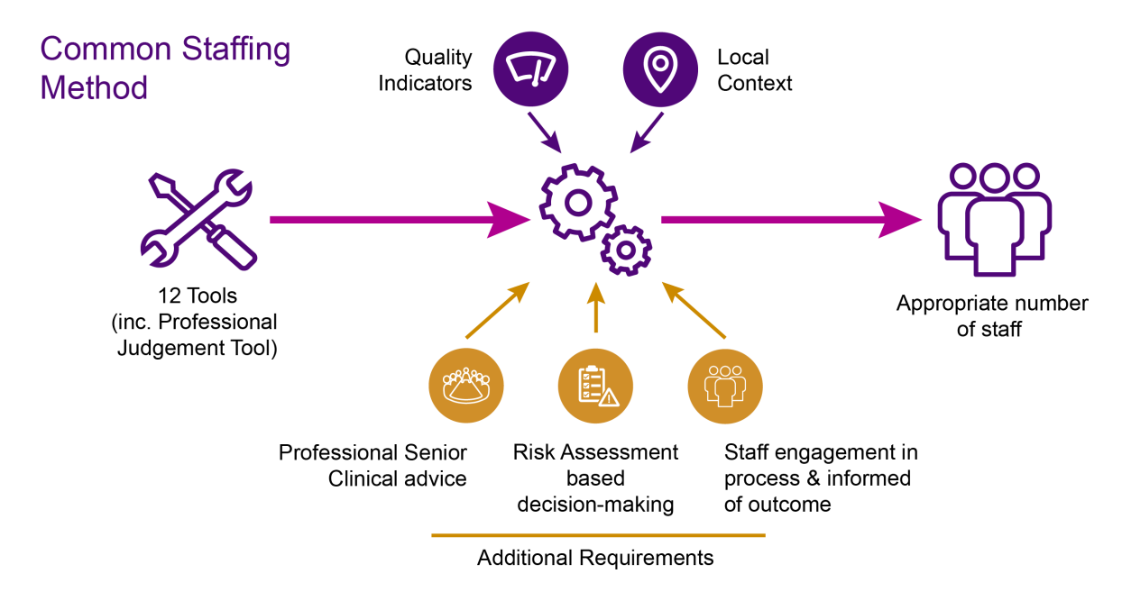
Figure 4: SPICe interpretation of 'common staffing method'