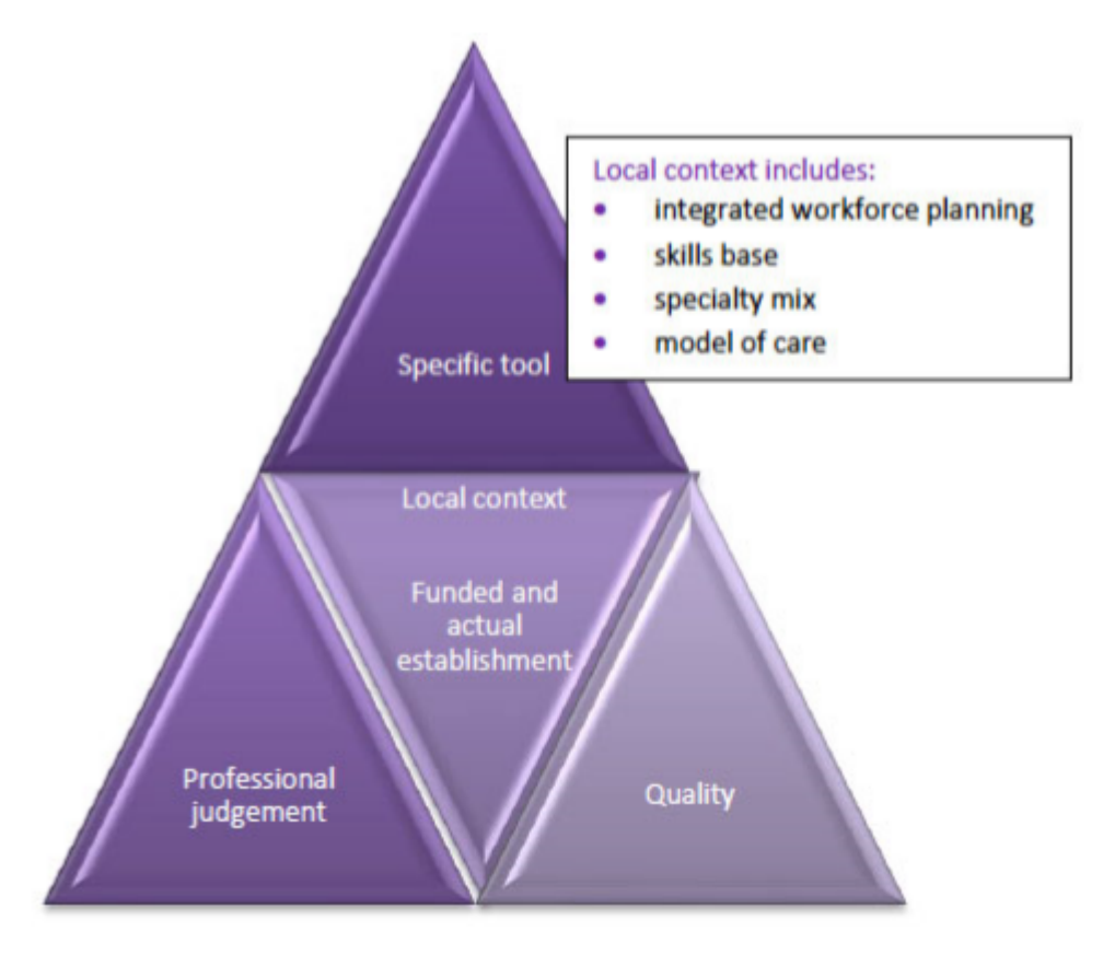
Figure 1: NHS Scotland Triangulation Diagram for workforce planning

24. The tools noted above are based on an average workload for each speciality across Scotland, and are supplemented by considering the specifics of local context - for example, the age profile of staff, local recruitment challenges; quality indicators and professional judgement. The Scotlish Government describe this as a triangulated approach. Figure 1 is produced by NHS Scotland to show the 'triangulated' process used as part of the staffing methodology.